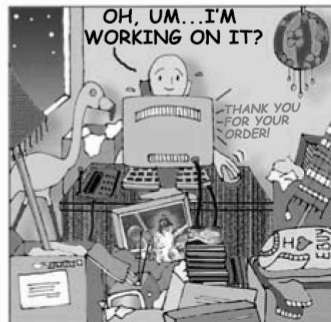
Cartoon reproduced from the NA Way magazine, July 2008, Volume 25, Number three

The Pacific Northwest 2009 Convention is looking for speakers for the Convention - Do you have a clear NA Message of recovery? We want to hear from addicts with different amounts of clean time and topics related to recovery.